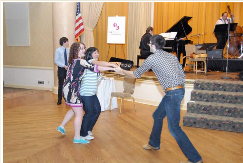
Lindy and Blues and Philly Lindy Hop showing off their swingin' moves.