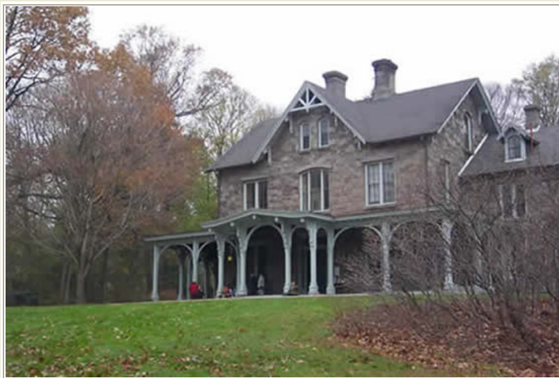
Francis Cope House at Awbury Arboretum

On Friday, April 23rd, Art-Reach will host its second annual Earth Day celebration. We will be partnering with Awbury Arboretum , Chanticleer Gardens and the Scott Arboretum to provide access to lush gardens and arboreta. In the spirit of the day, guests will partake in exclusive guided tours and experiences completely free of charge!