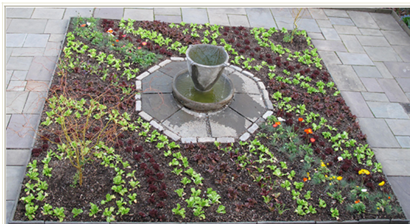
Chanticleer's Teacup Garden

The day's events kick off at Awbury Arboretum, where participants will work with the arboretum's educators to learn about invasive species, which are potentially harmful to the grounds, and help the staff remove them. This is a great opportunity for people looking to get their hands dirty while learning about our environment!